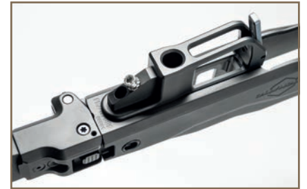
AR-15 type pistol grips compatible