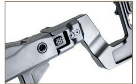
Integrated steel QD-mount