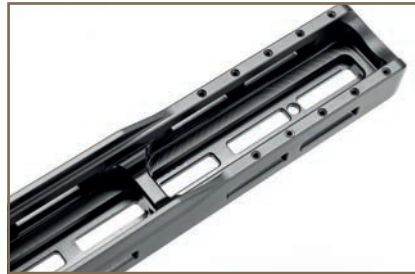
Night vision hood mount base