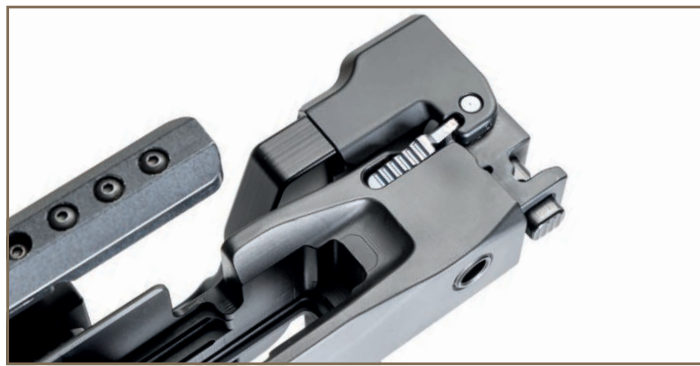
Buttstock folds to the right and hides bolt knob