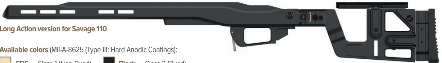
Long Action version for Savage 110

Available colors (Mil-A-8625 (Type III: Hard Anodic Coatings):