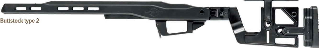
Buttstock type 2