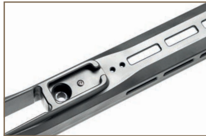
Proprietary and M-LOK compatible interface